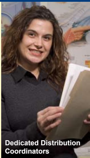
Dedicated Distribution Coordinators