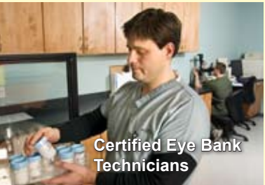
Certified Eye Bank Technicians