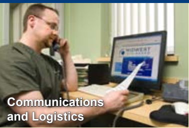
Communications and Logistics